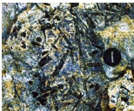
Figure 1. Prismatine (dark crystals) in cordierite (bluish matrix) near Prismatine Peak, Stornes.

The Larsemann Hills contains sedimentary and volcanic rocks that were laid down between 900 and 550 million years ago. Some of these rocks were unusually rich in boron. The rocks were subsequently buried, 'metamorphosed' (changed from one type of rock into another) at temperatures of 800-860°C, and squeezed by tectonic forces during the collision of East Gondwana and West Gondwana some 515-530 million years ago. The resultant amalgamation formed the super-continent Gondwana. Under these conditions the metamorphic rocks melted, resulting in two other rock types, 'granite' and 'pegmatite', both of which are common in the Larsemann Hills.