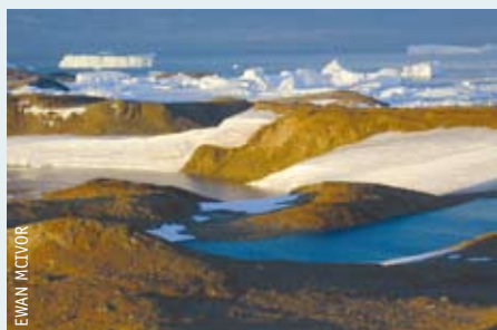
Following its designation as Antarctic Specially Managed Area No.6, international activities in the Larsemann Hills will be formally managed to safeguard the environmental and scientific values of this coastal 'oasis'.

Australia, China and the Russian Federation set up facilities in the Larsemann Hills in the late 1980s. Romania entered the scene a couple of years ago through an arrangement to use Australia's existing facilities, and India has recently installed some