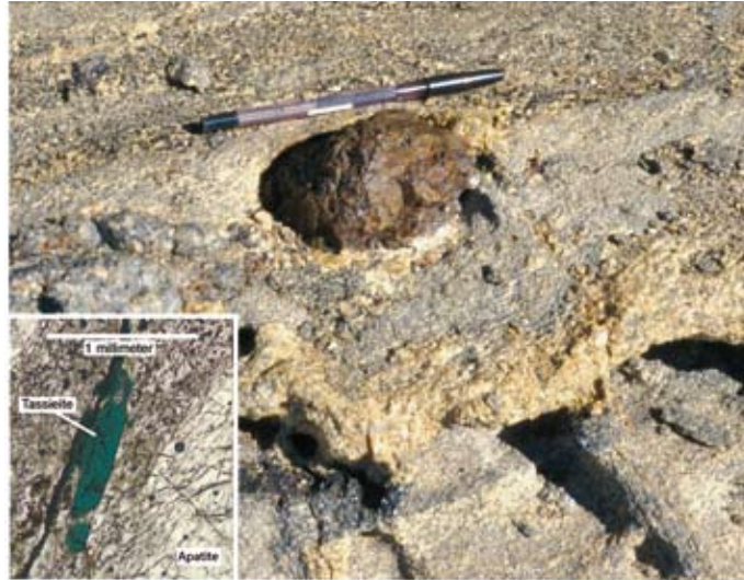
Figure 3. Photograph of the apatite nodule (next to pen) from which the crystals of stornesite-(Y) and tassieite were extracted to determine the physical and chemical properties of the two minerals. Inset is a photomicrograph of 'type' tassieite crystals in apatite in plane-polarised light. These crystals were used to characterise tassieite as a new species. From southwest of Johnston Fjord and near Tassie Tarn, Stornes.